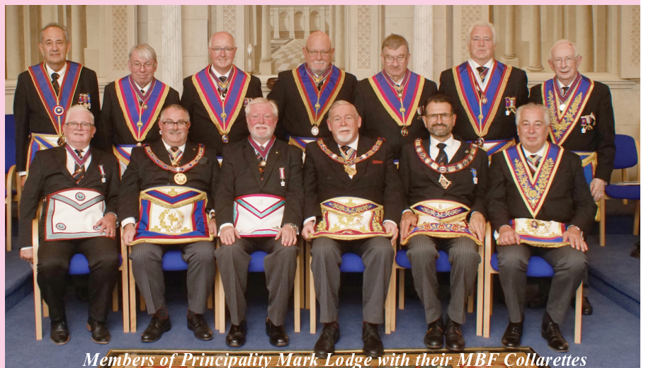
Members of Principality Mark Lodge with their MBF Collarettes