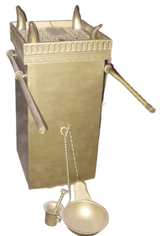
Golden Altar of Incense