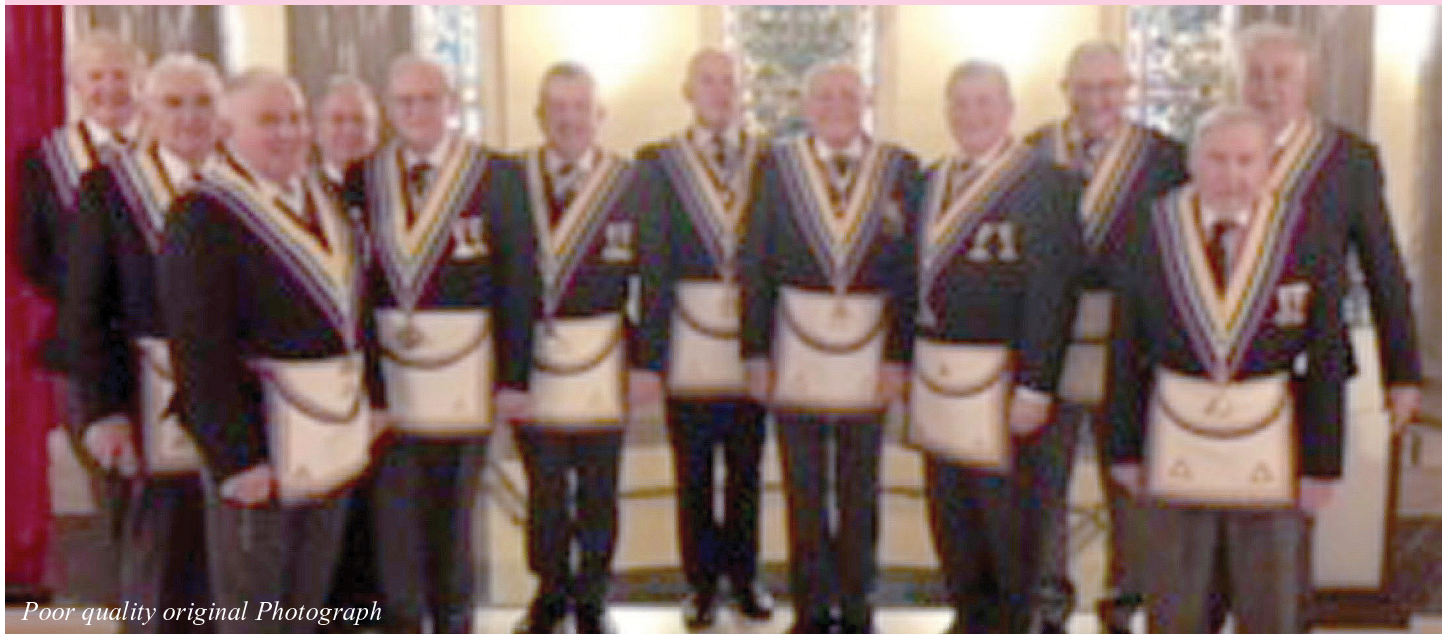
Poor quality original Photograph