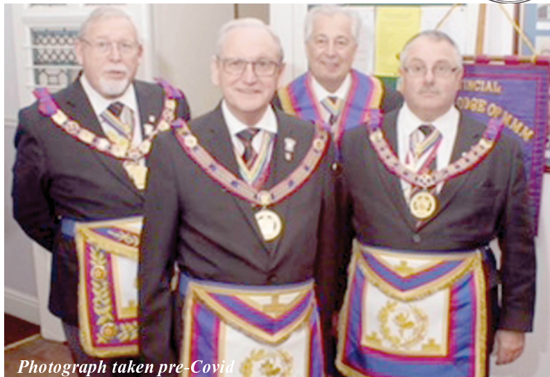
Photograph taken pre-Covid

The meeting conducted the usual business of the day, with