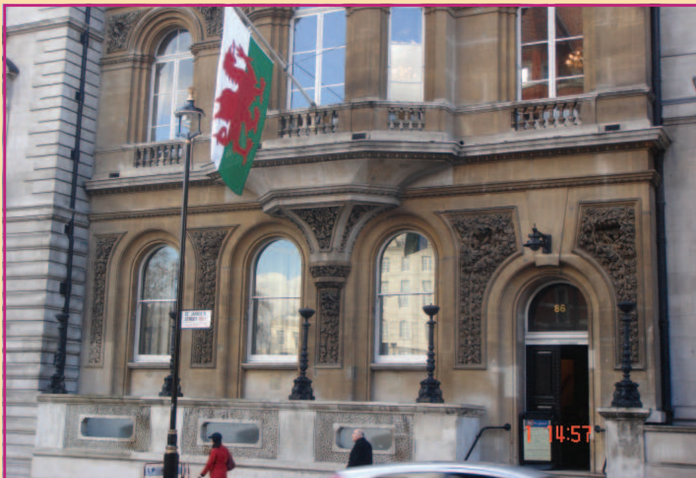
The Welsh Dragon was flying high at Mark Masons Hall, St. James's Street, London, to commemorate St. David's Day.