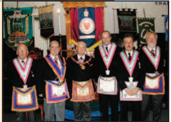
Consecration of the Barry Lodge Banner.

Stability Mark Lodge, through the offices of the Provincial Secretary, (we think he is a member of this lodge), was granted permission from Grand Lodge for the Banner Dedication ceremony to be performed in the company of ladies and invited guests. The Dedication took place after regular Lodge business had been transacted and the Lodge was closed. The brethren present wore their regalia according to their rank.