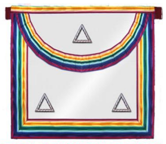
ROYAL ARK MARINER APRON

Elevation into the Royal Ark Mariner Degree commemorates the providence and mercy of God and relates to the legend of the deluge. The subject matter being taken directly from The Bible is naturally both beautiful and instructive. When the candidate enters the Lodge room his attention is directed to three pillars and at one stage the Ark is momentarily symbolised in terms similar to the Ark of Salvation. The candidate is finally instructed to advance in the spirit of the Cardinal Virtues.